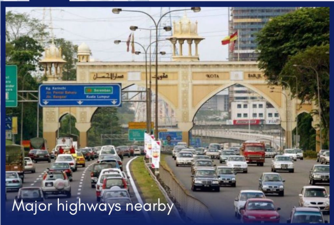
Major highways nearby