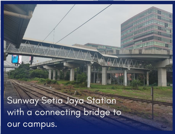
Sunway Setia Jaya Station with a connecting bridge to our campus.